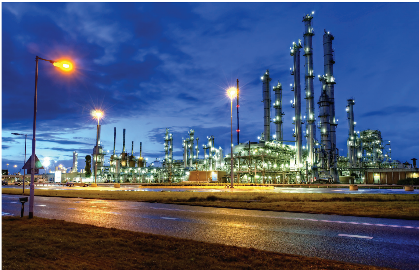
Figure: By systematically unlocking clues to increased profitability, Sherlock Holmes is literally left behind in this industrial game of Cluedo.

be used for rigorous profit-margin analysis when evaluating strategic reconfiguration options or operational improvements to the refinery. This becomes a handy tool in evaluating responses to unexpected operational events, as well as to determine turnaround and startup plans.